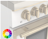
F4EDF486GBR1-RAL RAL CODE