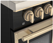
F4EDF486GBR1-BK GLOSSY BLACK RAL 9004