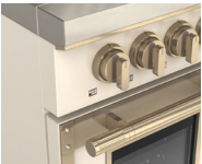
F4EDF486GBR1-MI MATTE IVORY RAL 1015