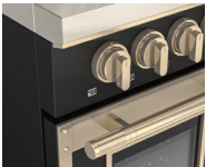
F4EDF486GBR1-MB MATTE BLACK RAL 9004