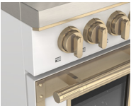
F4EDF486GBR1-MW MATTE WHITE RAL 9016